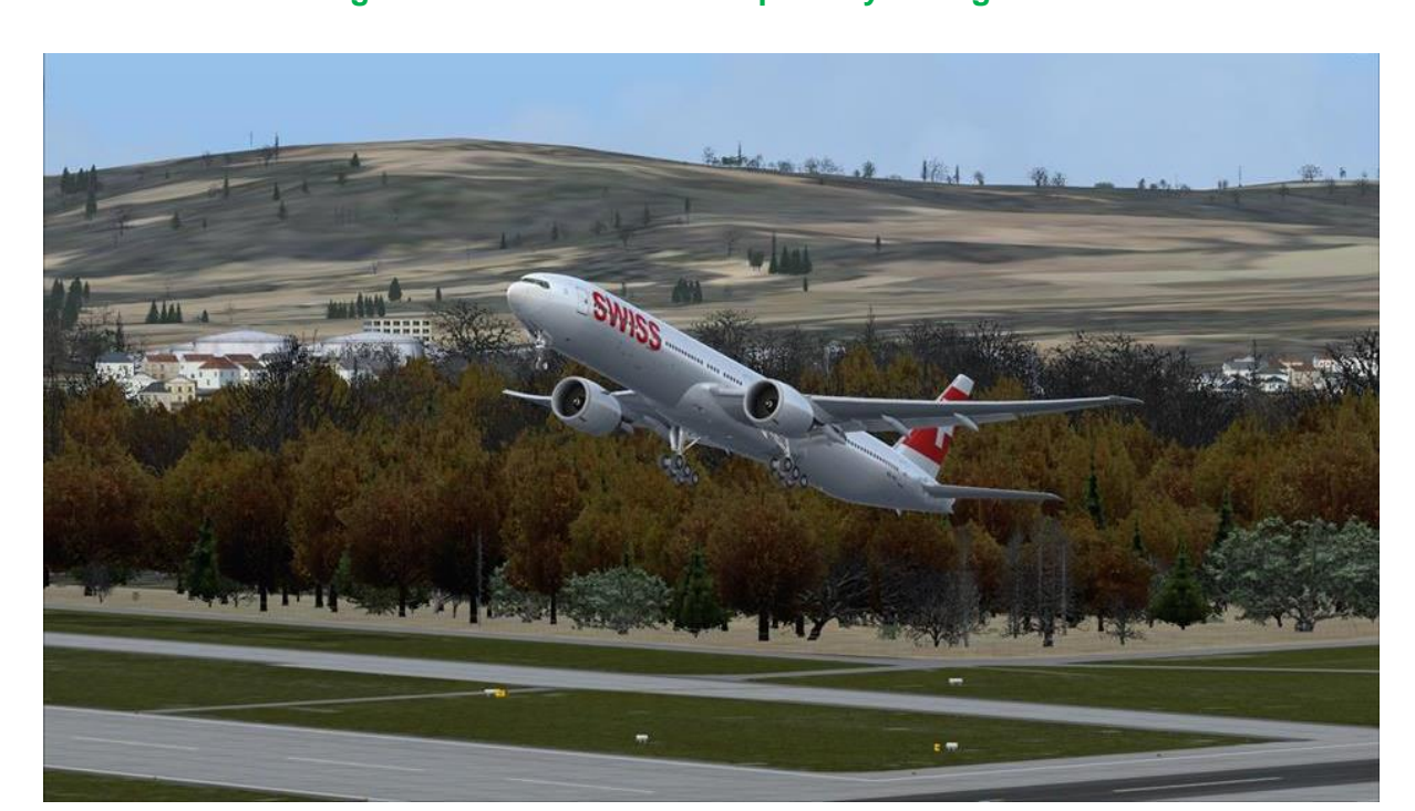
That's it! Congratulation! You have completed your flight with DLH Virtual!